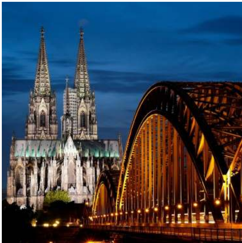
Cologne Cathedral, see Postcard inside.