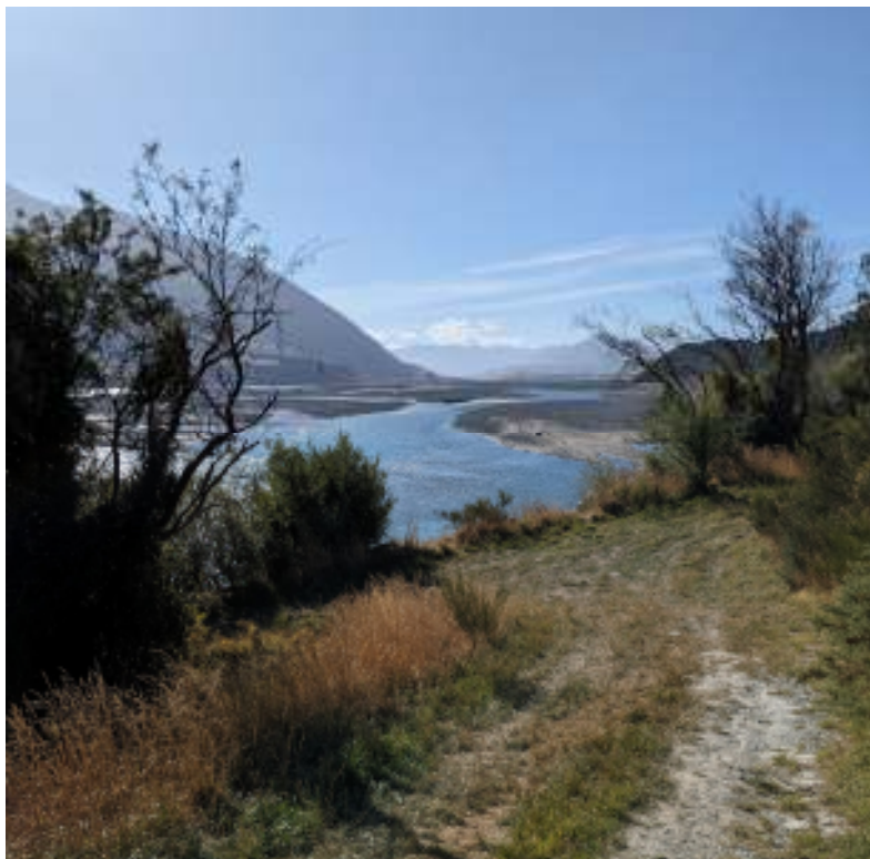
The Rakaia River, New Zealand, see Postcard inside.